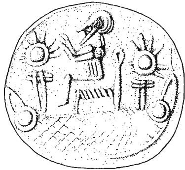
Impression, drawing of impression, and section of seal from Irbid, Jordan. Scale approximately 2.7:1.